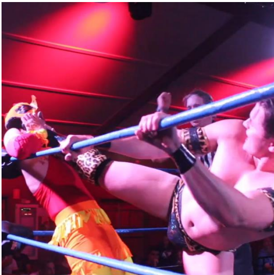
Something about chicken