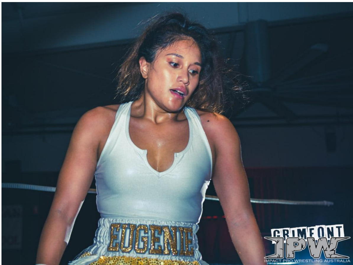
from IPW Triumphant 2021